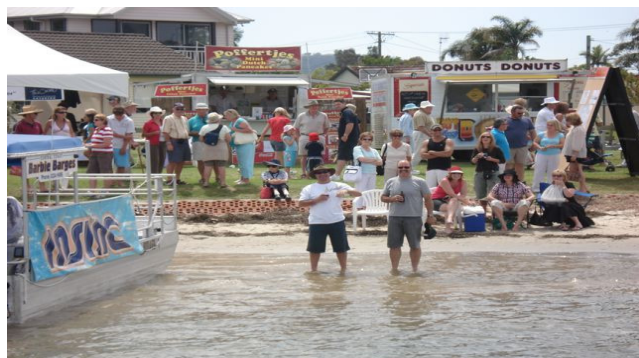
INSINC MARINE – The PRIDE of the FLEET !?!!

The big event of the day! The flotilla of putt putts led by the NSW Maritime Vessel will move along the waterway in front of the gathered spectators and at 11.15am and will continue around Brisbane Water with the first boats arriving back at approximately 12.30pm.