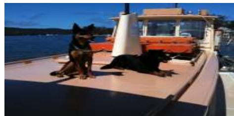
Ferry dogs Brandy & Indy sunning themselves on the CODOCK II during maintenance